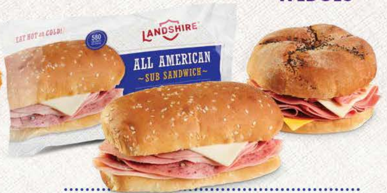
PRINTED FILM-WRAP DELI SANDWICHES