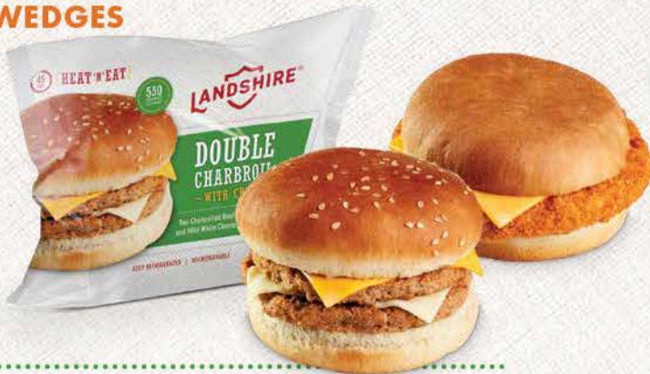
PRINTED FILM-WRAP WARM SANDWICHES