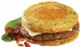
10000037518 Jimmy Dean® Florentine Frittata with Turkey Sausage and Cheese