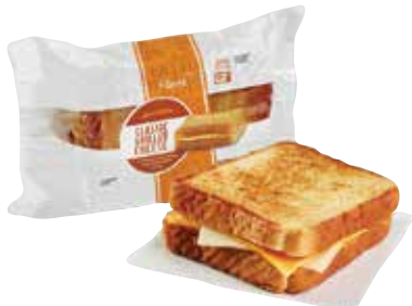
80304 / 10000080304 Pierre® Classic Grilled Cheese Sandwich