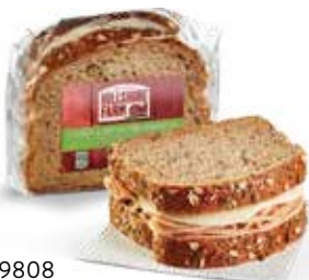
10000039808 Hillshire Farm® Turkey & Provolone Classic Sandwich