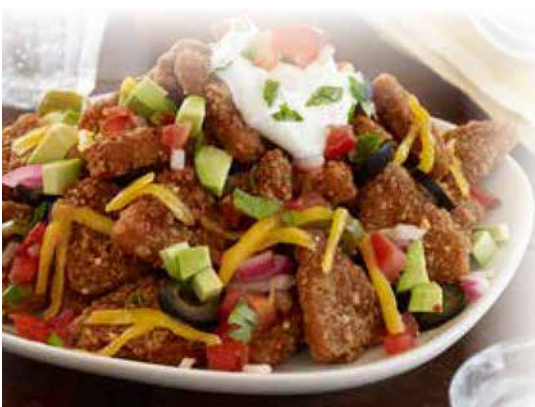
036547-0928 / 10365470928 Tyson® FC Chicken Chips, Smoky BBQ