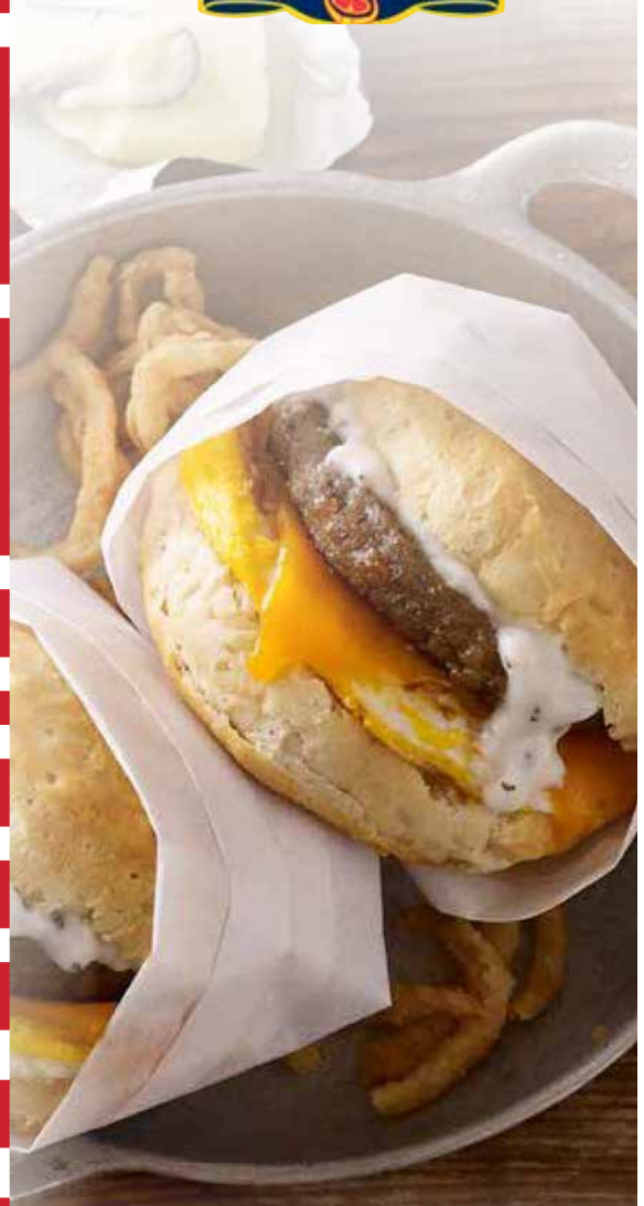
12896 / 10000012896 Jimmy Dean® FC Pork Formed Patties Maple 3.25" 1.5 oz.