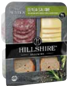
NEW! 20181 / 10000020181 Hillshire® Snacking Small Plates Genoa Salame and White Cheddar Cheese, 2.76 oz.