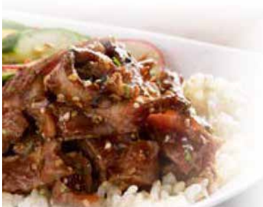
NEW! 1640-001 / 10000016401 CAB® Brand Steak-EZE® BreakAway® UC Sirloin Steak, 4 oz.