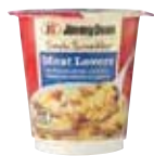
NEW! 65046 / 10000065046 Jimmy Dean Simple Scrambles® Meat Lovers Breakfast Cups, 5.35 oz.