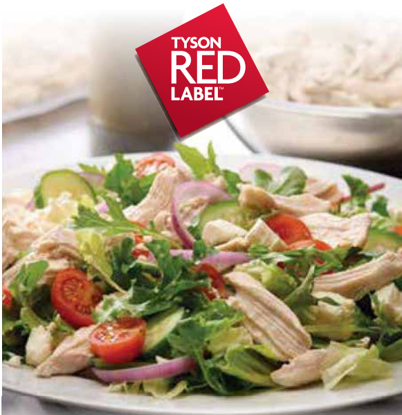
024475-0928 / 10244750928 Tyson® NAE ^ FC All Natural* Low Sodium Pulled Breast Meat