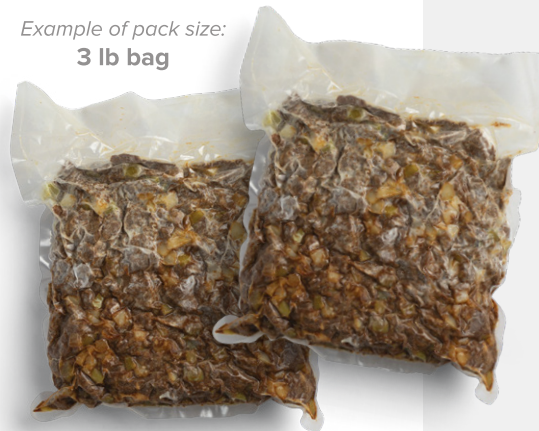
Example of pack size: 3 lb bag

Shipped frozen for 365-day shelf life, all Steak-EZE ® brand and Original Philly ® brand Fully Cooked CIB products will be marinated, seared, and sliced at our state-of-the-art production facilities, seasoned using our proprietary flavor profiles, then placed in cook cycle bags, blast frozen, weighed for quality control, and packed into cases for shipping.