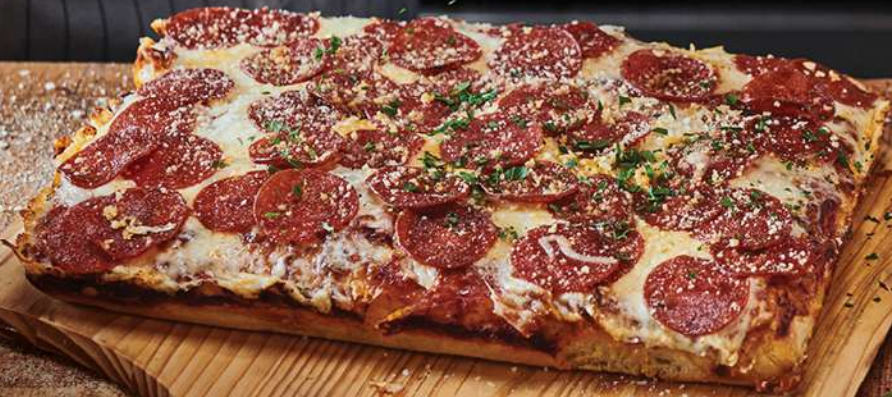
10157320393 Hillshire Farm ® Pork, Beef Sliced Pepperoni