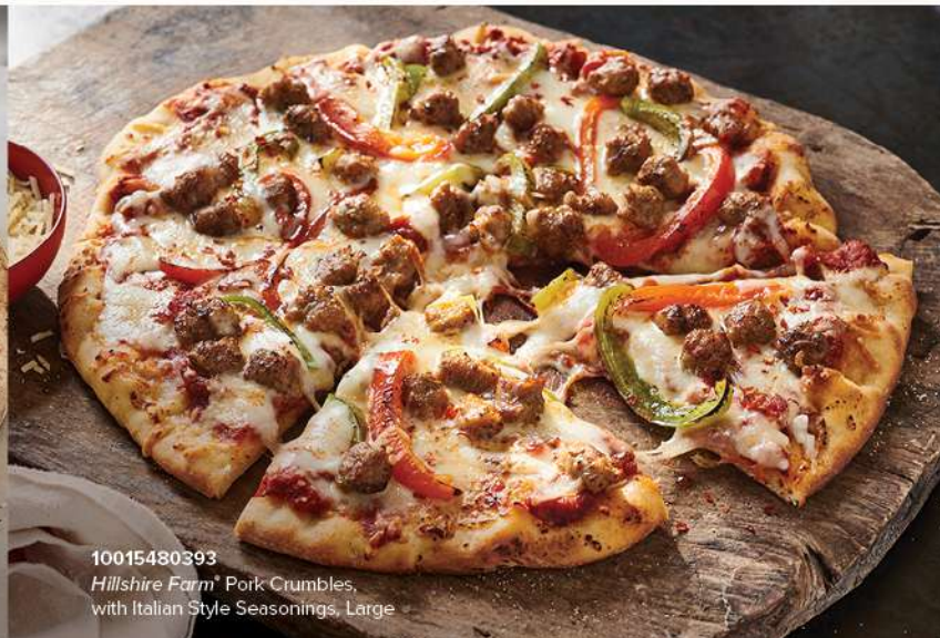
10015480393 Hillshire Farm® Pork Crumbles, with Italian Style Seasonings, Large