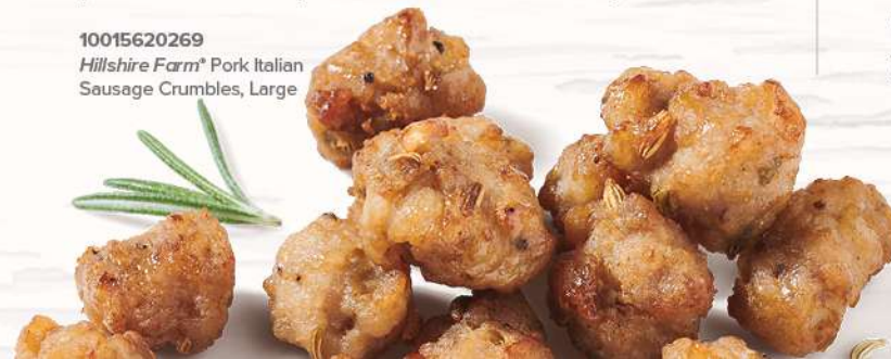
10015620269 Hillshire Farm ® Pork Italian Sausage Crumbles, Large

Hillshire Farm ® brand offers easy-to- prep, fully cooked products that enhance back-of-house efficiencies, add speed to plate and help reduce food safety risks.