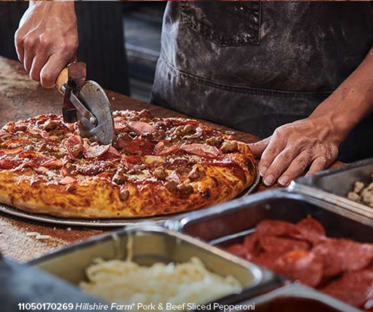
11050170269 Hillshire Farm® Pork & Beef Sliced Pepperoni 11025620269 Hillshire Farm® Beef Crumbles, Regular 11044350269 Hillshire Farm® Sliced & Quartered Ham 11018170269 Hillshire Farm® Pork Crumbles with Spicy Italian Style Seasonings, Large