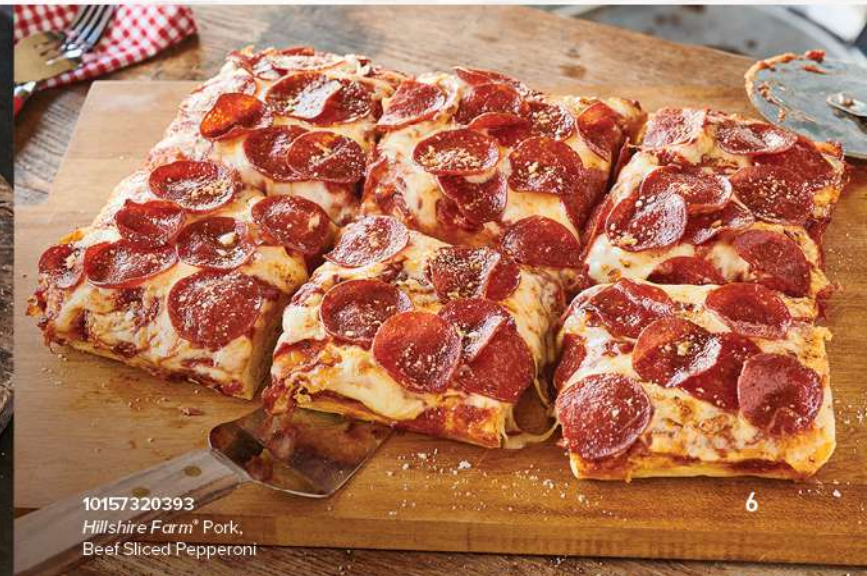
10157320393 Hillshire Farm® Pork, Beef Sliced Pepperoni