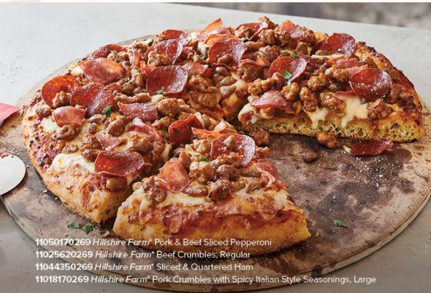
11050170269 Hillshire Farm® Pork & Beef Sliced Pepperoni 11025620269 Hillshire Farm® Beef Crumbles, Regular 11044350269 Hillshire Farm® Sliced & Quartered Ham 11018170269 Hillshire Farm® Pork Crumbles with Spicy Italian Style Seasonings, Large