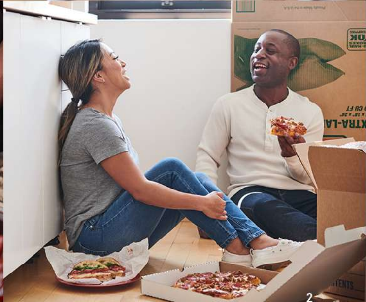
11042160269 Hillshire Farm® Pork & Beef Sliced Pepperoni 10044410654 Hillshire Farm® Sliced Genoa Salami