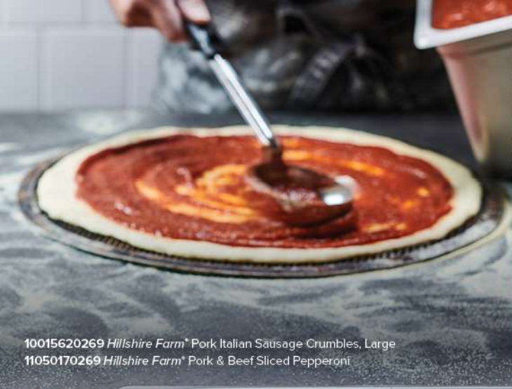
10015620269 Hillshire Farm® Pork Italian Sausage Crumbles, Large 11050170269 Hillshire Farm® Pork & Beef Sliced Pepperoni