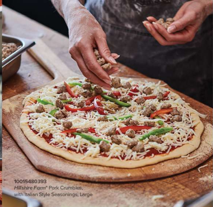
10015480393 Hillshire Farm® Pork Crumbles, with Italian Style Seasonings, Large