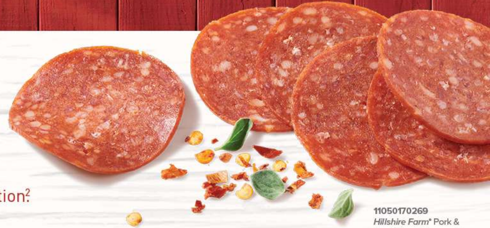
11050170269 Hillshire Farm ® Pork & Beef Sliced Pepperoni